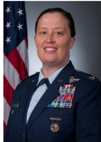
Colonel Courtney Hamilton

The 307th Bomb Wing provides combat ready aircrew, maintenance and combat support personnel for nuclear and conventional global operations. It is the only unit in the Air Force currently operating both the B-52 and the B-1 Lancer simultaneously.